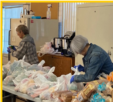
Ladies from DCUMC getting our giveaway food items table ready for Saturday customers.

If you would like more information on donating or volunteering, please call Nancy January at (715) 492-