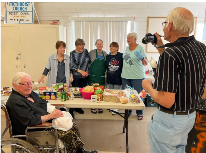
Volunteers & Friends always enjoy fellowship time together at Community Feast.